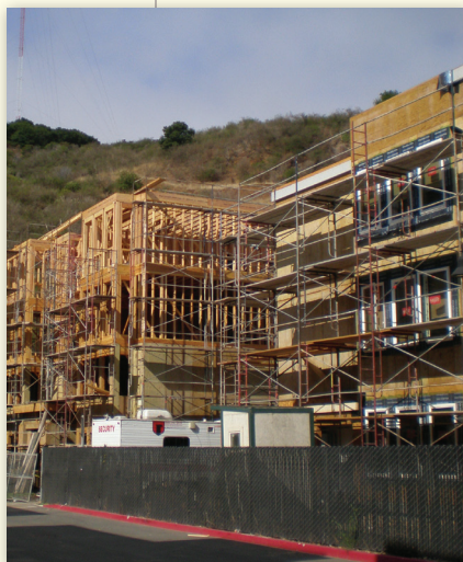
Overlooking Candlestick Park, the Candlestick Heights development, offers generously sized and well-appointed one, two, three and four bedroom apartment homes all with gas stoves.