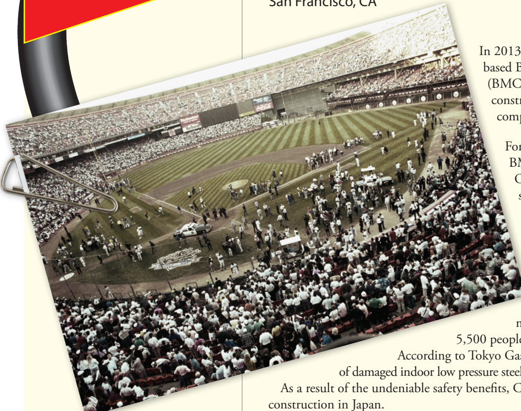
On October 17, 1989 at 5:04 P.M., the World Series earthquake struck Candlestick Park.