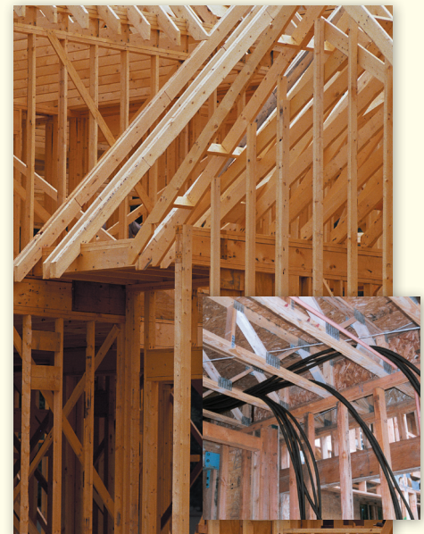
3/4" 1" and 1 1/4" CounterStrike CSST was installed to provide natural gas to each apartment.