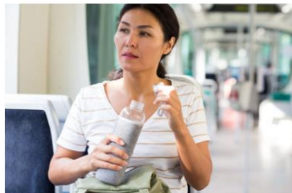
On The Go